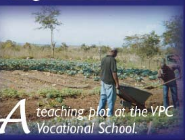
A teaching plot at the VPC Vocational School.

Please pray for this ministry, which VPC supports, and also visit www.cchaiti.org for more information.